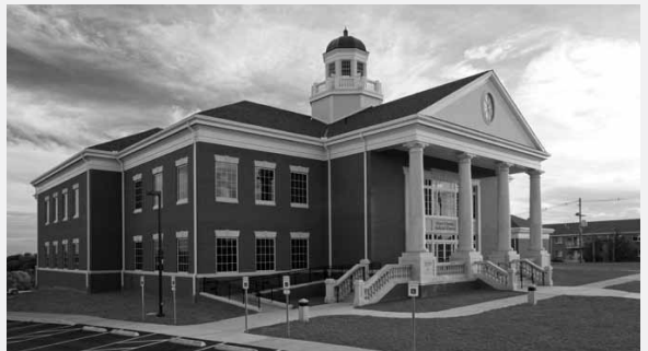
Project architect JRA Architects, Louisville, Kentucky.

Thank you for purchasing Hurd products. They're made of the finest materials, engineered with the newest technology, and built with a great deal of pride by our Hurd family.